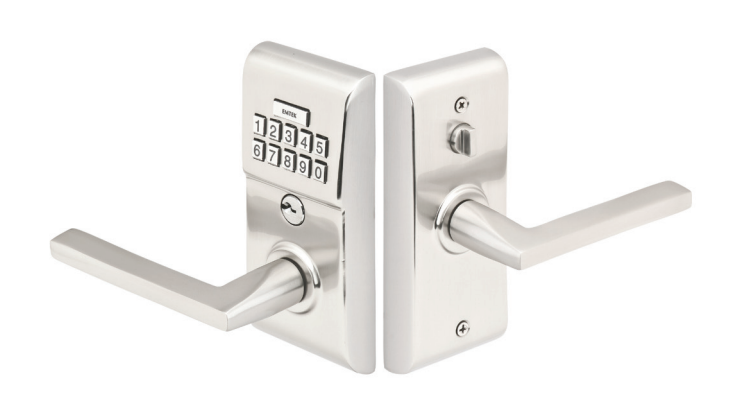
Exterior Trim Interior Trim

Shown in Satin Nickel (US15) finish with Helios Levers*