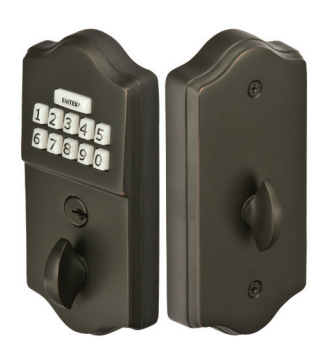
Exterior Trim Interior Trim

Shown in Oil Rubbed Bronze (US10B) finish