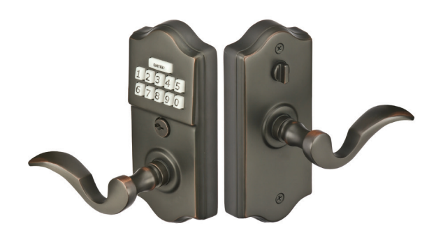
Exterior Trim Interior Trim

Shown in Oil Rubbed Bronze (US10B) finish with Cortina Levers ^{st}