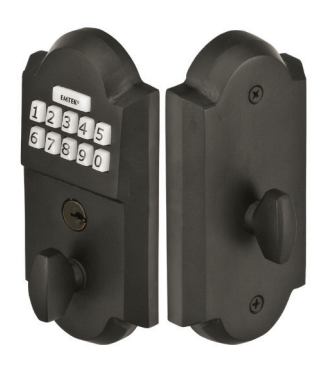
Exterior Trim Interior Trim