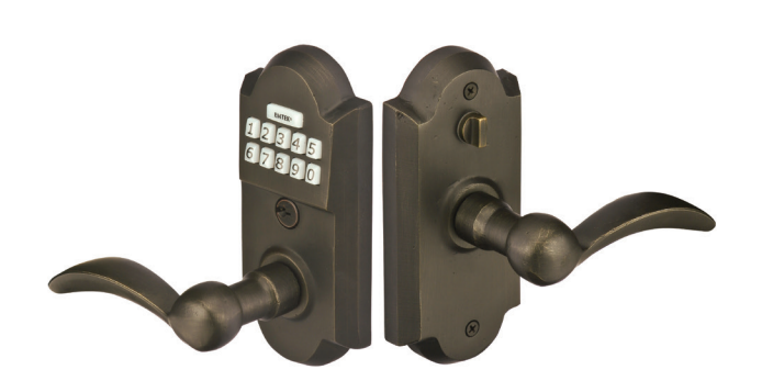
Exterior Trim Interior Trim

Shown in Medium Bronze (MB) finish with Durango Levers*