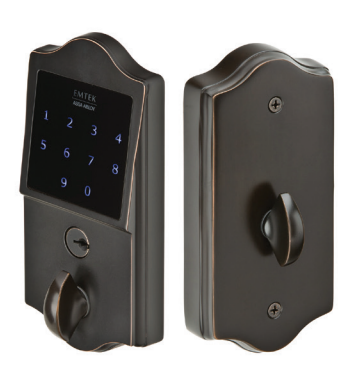
Exterior Trim Interior Trim

Shown in Oil Rubbed Bronze (US10B) finish